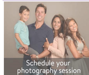
Schedule your photography session

Our member site URL: https://booknow-lifetouch.appointment-plus.com/yqlr8314/